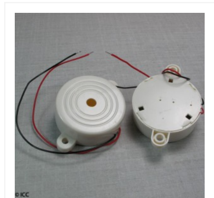
PIEZO SOUNDER WITH BUILT-IN CIRCUIT