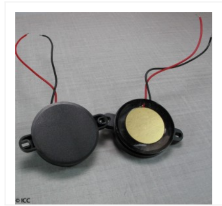
PIEZO ELECTRIC ALARM W/ CIRCUITRY - WATERPROOF