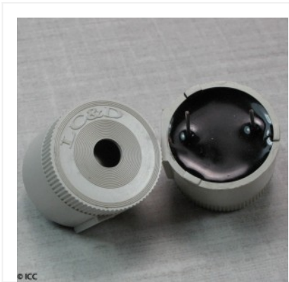
PIEZO ELECTRIC ALARM WITH INTERNAL CIRCUITRY