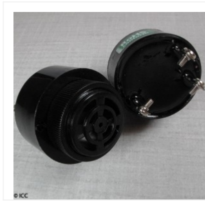
PIEZO ELECTRIC ALARM WITH INTERNAL CIRCUITRY