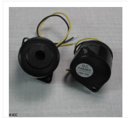
PIEZO ELECTRIC ALARM WITH INTERNAL CIRCUITRY