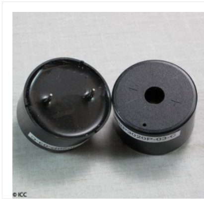
PIEZO ELECTRIC ALARM WITH INTERNAL CIRCUITRY