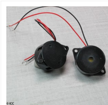
PIEZO ELECTRIC ALARM WITH INTERNAL CIRCUITRY