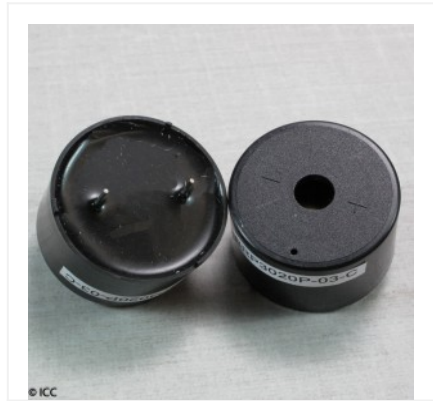
PIEZO ELECTRIC ALARM WITH INTERNAL CIRCUITRY