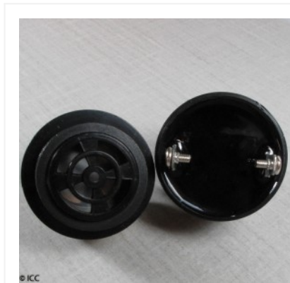
PIEZO ELECTRIC ALARM WITH INTERNAL CIRCUITRY