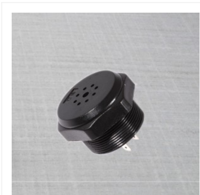
PIEZO ELECTRIC ALARM WITH INTERNAL CIRCUITRY