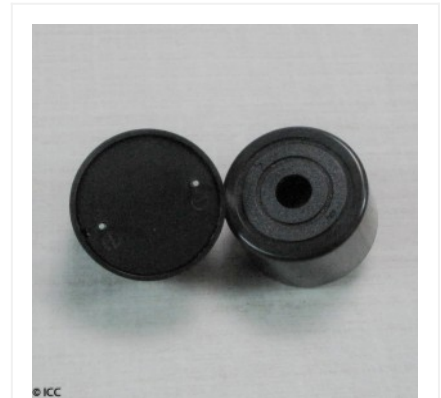
PIEZO ELECTRIC ALARM WITH INTERNAL CIRCUITRY