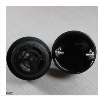
PIEZO ELECTRIC ALARM WITH INTERNAL CIRCUITRY