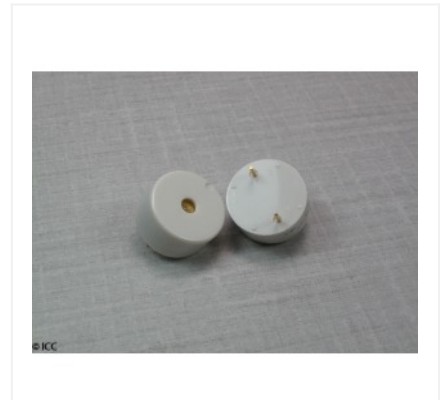
PIEZO ELECTRIC ALARM WITH INTERNAL CIRCUITRY