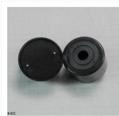
PIEZO ELECTRIC ALARM WITH INTERNAL CIRCUITRY