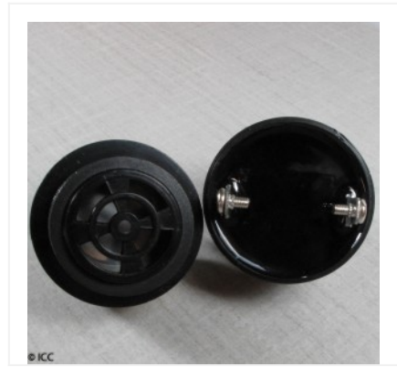
PIEZO ELECTRIC ALARM WITH INTERNAL CIRCUITRY