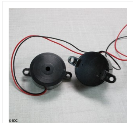
PIEZO ELECTRIC ALARM WITH INTERNAL CIRCUITRY