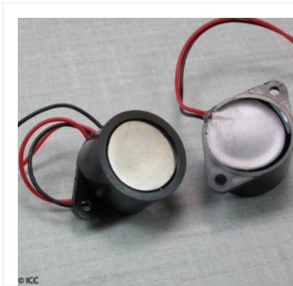
PIEZO ELECTRIC ALARM W/ CIRCUITRY - WATERPROOF