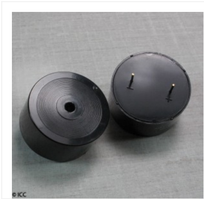
PIEZO ELECTRIC ALARM WITH INTERNAL CIRCUITRY