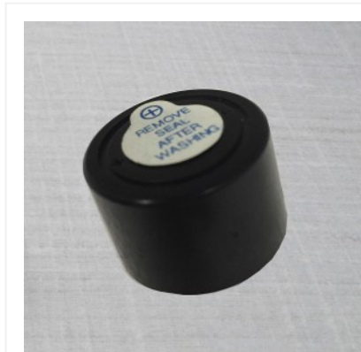
PIEZO ELECTRIC ALARM WITH INTERNAL CIRCUITRY