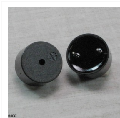
PIEZO ELECTRIC ALARM WITH INTERNAL CIRCUITRY