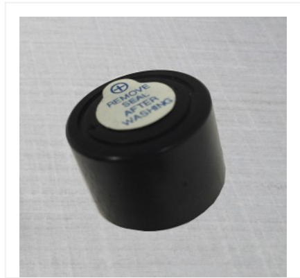
PIEZO ELECTRIC ALARM WITH INTERNAL CIRCUITRY