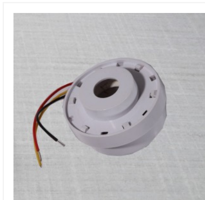
PIEZO ELECTRIC ALARM WITH INTERNAL CIRCUITRY