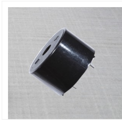
PIEZO ELECTRIC ALARM WITH INTERNAL CIRCUITRY