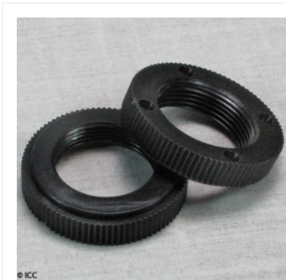
ACCESSORY MOUNTING NUT FOR PANEL MOUNT SERIES BRP3025