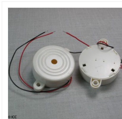
PIEZO SOUNDER WITH BUILT-IN CIRCUIT