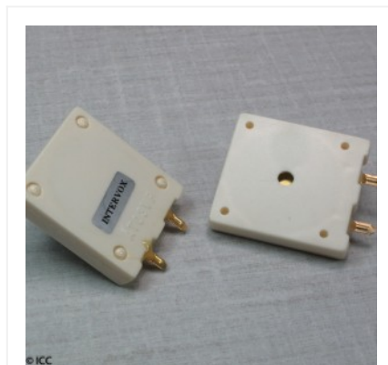
EXTERNAL DRIVE PIEZO ELECTRIC