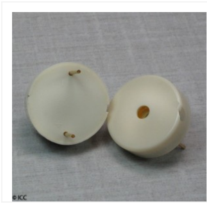
EXTERNAL DRIVE PIEZO ELECTRIC