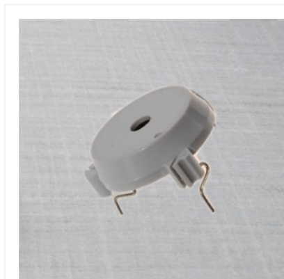
SELF-DRIVE PIEZO ELECTRIC BUZZER