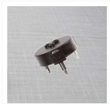
SELF DRIVE PIEZO ELECTRIC BUZZER