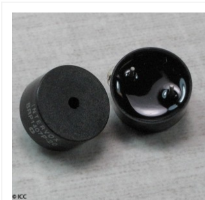
EXTERNAL DRIVE PIEZO ELECTRIC