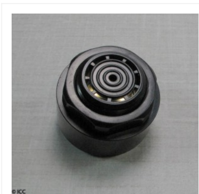
EXTERNAL DRIVE PANEL MOUNT PIEZO ELECTRIC