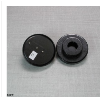
SELF DRIVE PIEZO ELECTRIC BUZZER