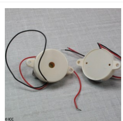
EXTERNAL DRIVE PIEZO ELECTRIC