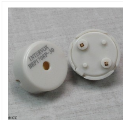
EXTERNAL DRIVE PIEZO ELECTRIC