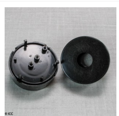
SELF-DRIVE PIEZO ELECTRIC BUZZER