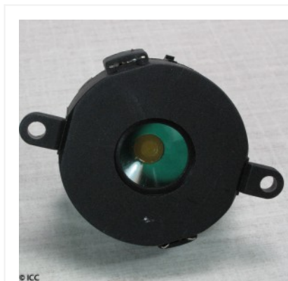
EXTERNAL DRIVE DUAL CONTROL PIEZO ELECTRIC