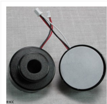
SELF DRIVE PIEZO ELECTRIC BUZZER W/WIRES AND MOLEX CONNECTOR