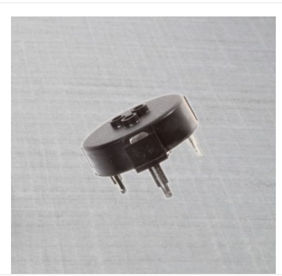
SELF DRIVE PIEZO ELECTRIC BUZZER