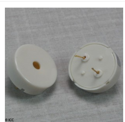
EXTERNAL DRIVE PIEZO ELECTRIC