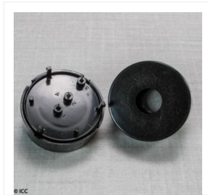
SELF-DRIVE PIEZO ELECTRIC BUZZER